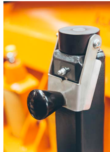
top left: blade folding back in case of road obstacles top right: kugelmann scraper blade bottom left: Cellasto shock absorber bottom center: hydraulic control block bottom right: vertically adjustable slide pad