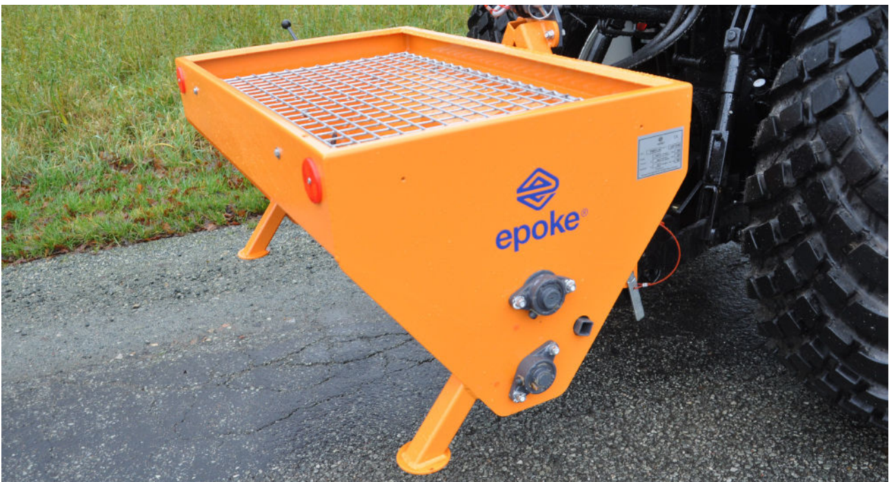
The PM series is ideal for fitting to smaller carrying vehicle with three-point suspension category 0/1.

The PM series undergoes the same thorough surface treatment as all other Epoke spreaders, meaning the spreaders are well protected against rust.