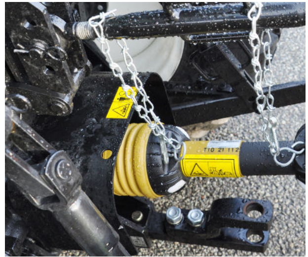
PM 1,4 powered by the tractor's PTO.