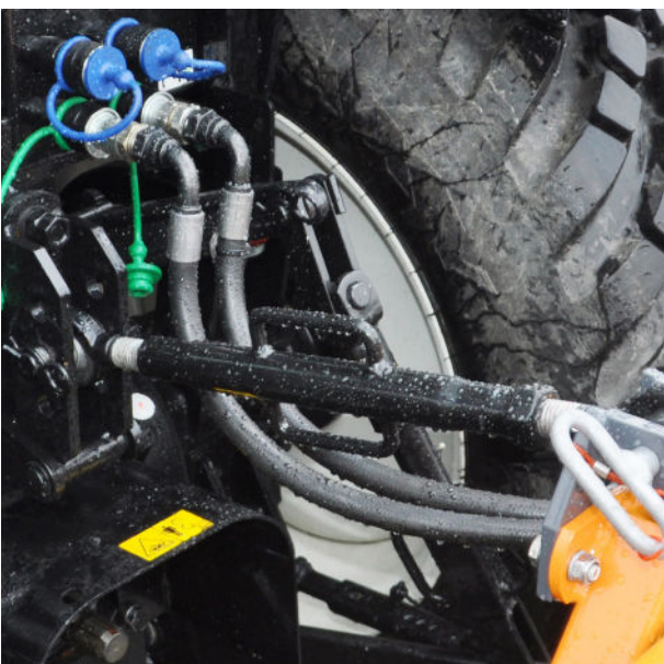
PM 1,4 powered by a hydraulic pump.