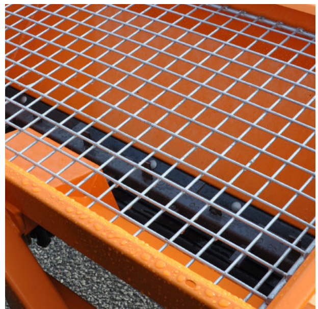
The safety grate prevents unwanted access to the agitator and distributor roller.